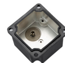
Camera Backshell Housing Assembly